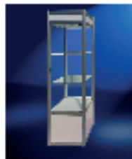
Octanorm Tall Showcase 50 x 50 x 200 cm