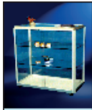
Low Showcase 100 x 50 x 100 cm

Dubai International Convention and Exhibition Centre, Dubai - UAE