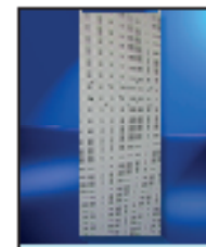
Big Pegboard 90 x 240 cm