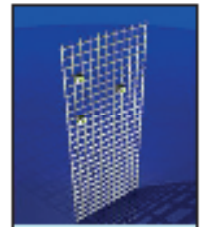
Grid Panel 90 x 180 cm