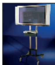
LED TV Screen 42" & 32"