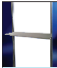
Flat Shelf 100 x 30 cm