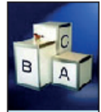
Exhibit Base H: 50 x 50 x 50 cm H: 50 x 50 x 75 cm H: 50 x 50 x 100 cm