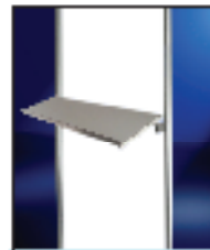
Slope Shelf 100 x 30 cm