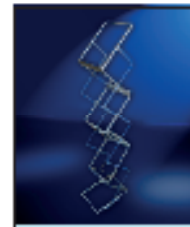
Brochure Holder Zig Zag