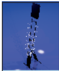
Brochure Rack Free Standing