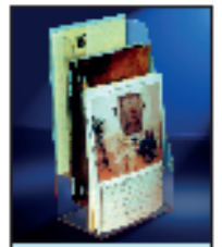
Brochure Holder Table Top