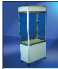
Tall Showcase 85 x 45 x 190 cm