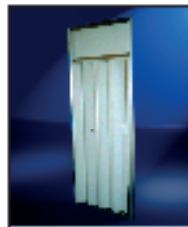
Folding Door 200 x 100 cm