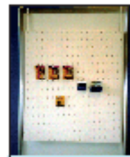
Small Pegboard 90 x 120 cm