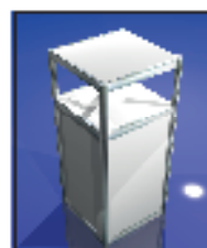
TV Stand 50 x 50 x 120