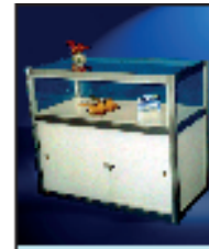
Octanorm Showcase 100 x 50 x 90 cm