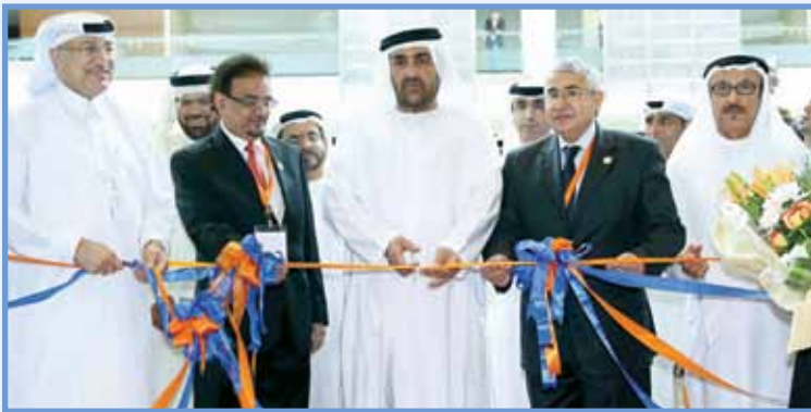
H.E. Dr. Rashid Ahmad Bin Fahad, Minister of Environment and Water, inaugurated the 15 th Dubai World Dermatology and Laser Conference and Exhibition - Dubai Derma 2015 at the Dubai International Convention and Exhibition Centre.